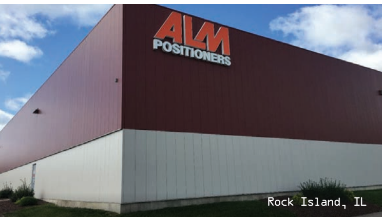
Rock Island, IL