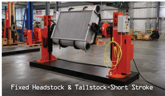
Fixed Headstock & Tailstock-Short Stroke