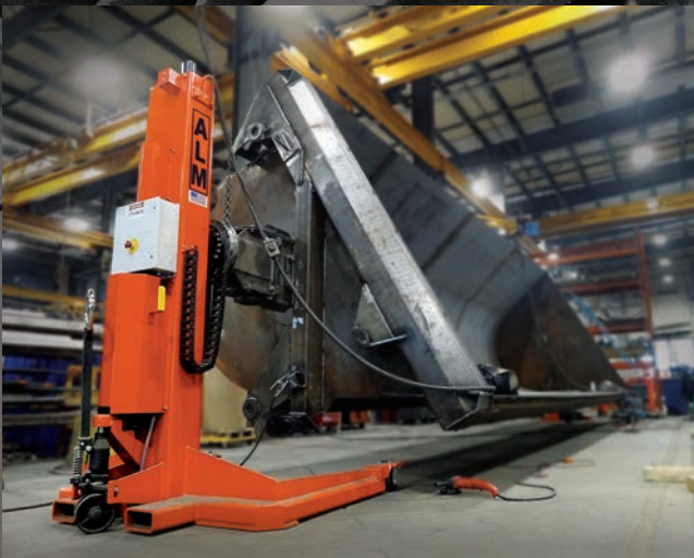
Fixed Headstock & Mobile Tailstock