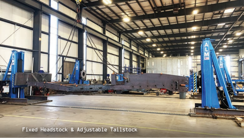
Fixed Headstock & Adjustable Tailstock